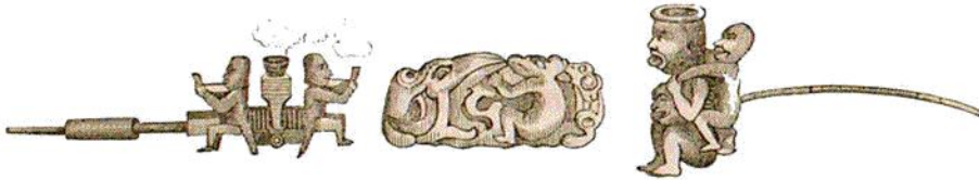
PIPES OF THE NORTHWEST INDIANS.

engage in the diversion. Some of the masks are sufficiently hideous, while others are carved with skill: they use the soft pine for this purpose. The wood is variously stained with red, black, and yellow marks. The two of these represented in the engraving will give a good idea of those that are the best executed. The pipes, saucers, &c., are usually carved from clay.