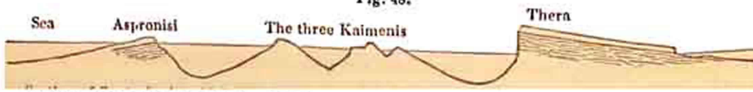
Section of Santorin, in a N.E. and S.W. direction, from Thera through the Kaimenis to Aspronisi.