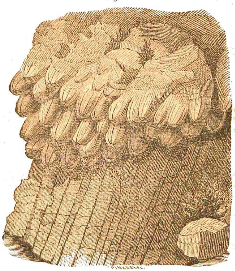
Titan's Piazza, Mt. Holyoke.