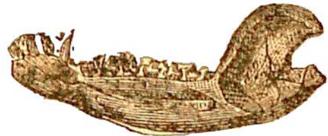
Fig. 111.—Jaw of Phascolotherium.

The name of Thylacotherium , or Amphitherium , or Phascolotherium , is given to the first of these marsupial Mammals which made their appearance, whose remains have been discovered in the Lower Oolite, and in one of its higher stages, namely, that called the Great Oolite . Fig. 110 represents the jaw of the first of these animals, and Fig. 111 the other—both of the natural size. These jaw-bones represent all that has been found belonging to these early marsupial animals ; and Baron Cuvier and Professor Owen have both decided as to their origin. The first was found in the Stonesfield quarries. The Phascolotherium, also a Stonesfield fossil, was the ornament of Mr. Broderip's collection. The animals which lived on the land during the Lower Oolitic period would be nearly the same with those of the Liassic. The insects were, perhaps, more numerous.