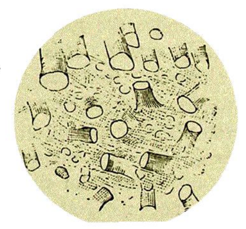
FIG. 19.—Canals of Eozoon. Ilighly Magnified.